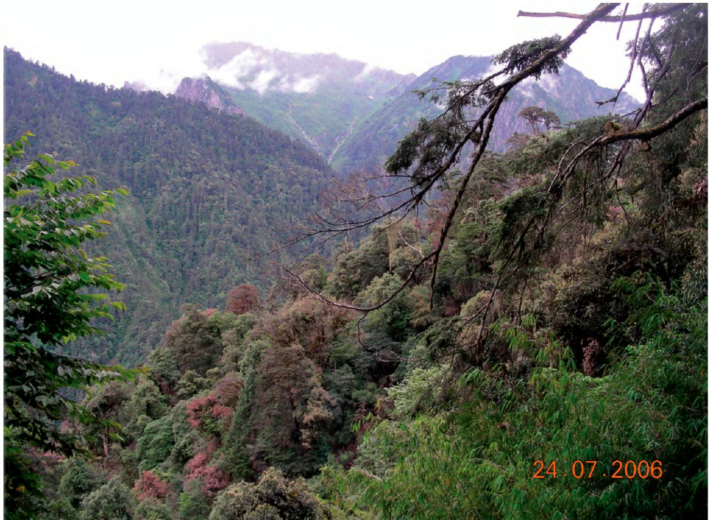
Figure 12. Habitat of P. atroguttata and P. xiushani sp. n. in northwestern Yunnan, alt. 2800m